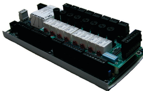
Legacy MultiFlex Design