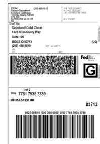
Pre-paid FedEx label