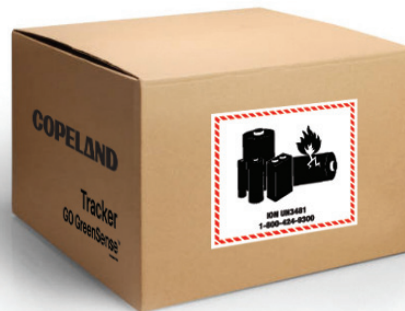
Box displaying lithium_ion battery warning