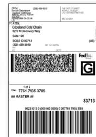
Pre-paid FedEx label