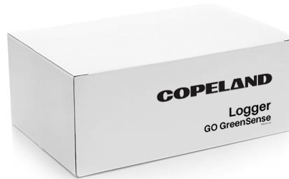
Logger shipping box