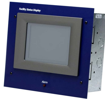
FSD P/N 850-5100

Should the ribbon cable need to be reinstalled, follow the Installation procedure.