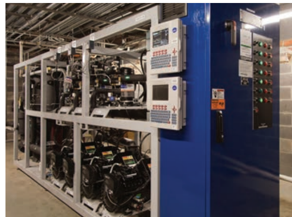
Hillphoenix warm climate CO 2 -based transcritical booster system installation utilizing Emerson Climate Technologies components

A key enabling feature of the CO 2 transcritical booster system is an adiabatic condenser, which was designed to operate in high ambient temperatures. Adiabatic condenser cooling is the process of spraying