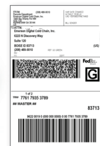
Pre-Paid FedEx Label