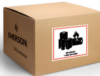
Box Displaying Lithium_ion Battery Warning