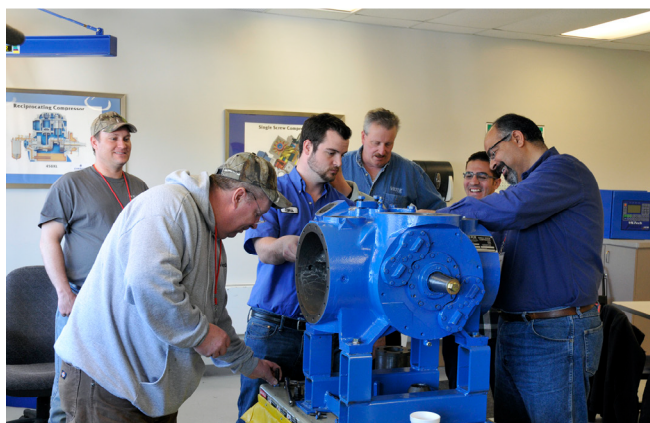
Vilter service training center