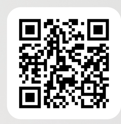
Scan for Cooper-Atkins Probes for Foodservice Catalog

Contact your Cooper-Atkins rep to learn more.