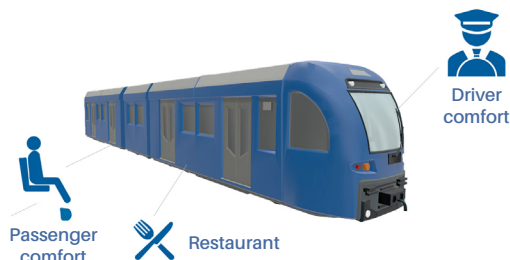
Copeland scroll compressors provide comfort throughout trains

We offer a wide range of vertical and horizontal scroll compressors. Because of the need to switch to alternative refrigerants with a lower GWP, Copeland provides alternatives for medium or low-pressure refrigerants as well as solutions for R290.