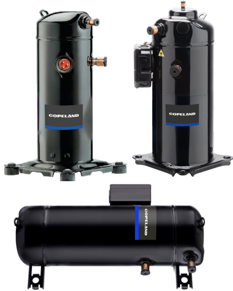
Copeland scroll vertical and horizontal compressors

Reaching efficiency targets throughout the cold chain